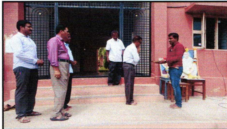
Gandhi Jayanthi and Lalbahaddur Shastri Jayanthi and Blood Donation Day, Date : 02 -10-2018