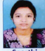
Sporthi GPA - 7.60