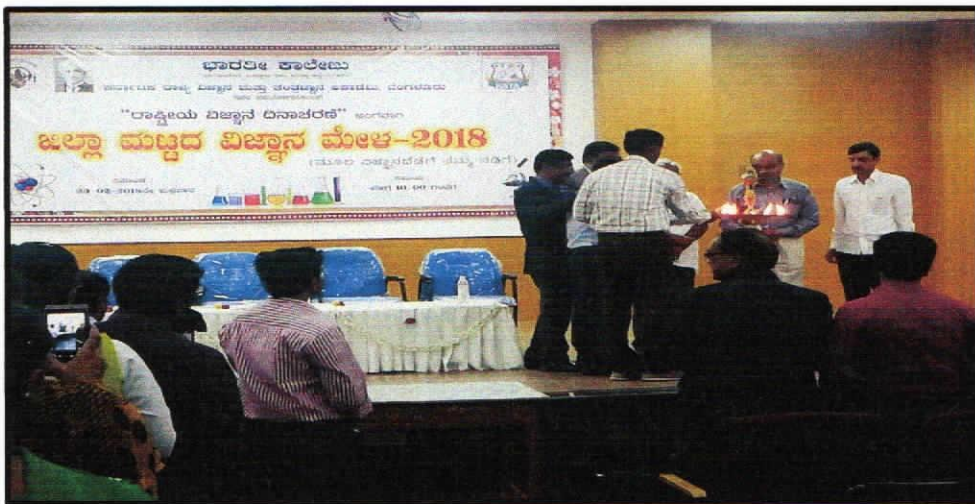
Date:-22-02-2018, A one day District Level Vijnana Mela 2018 District Level Science Exhibition with the theme "Basic Science & Technology"