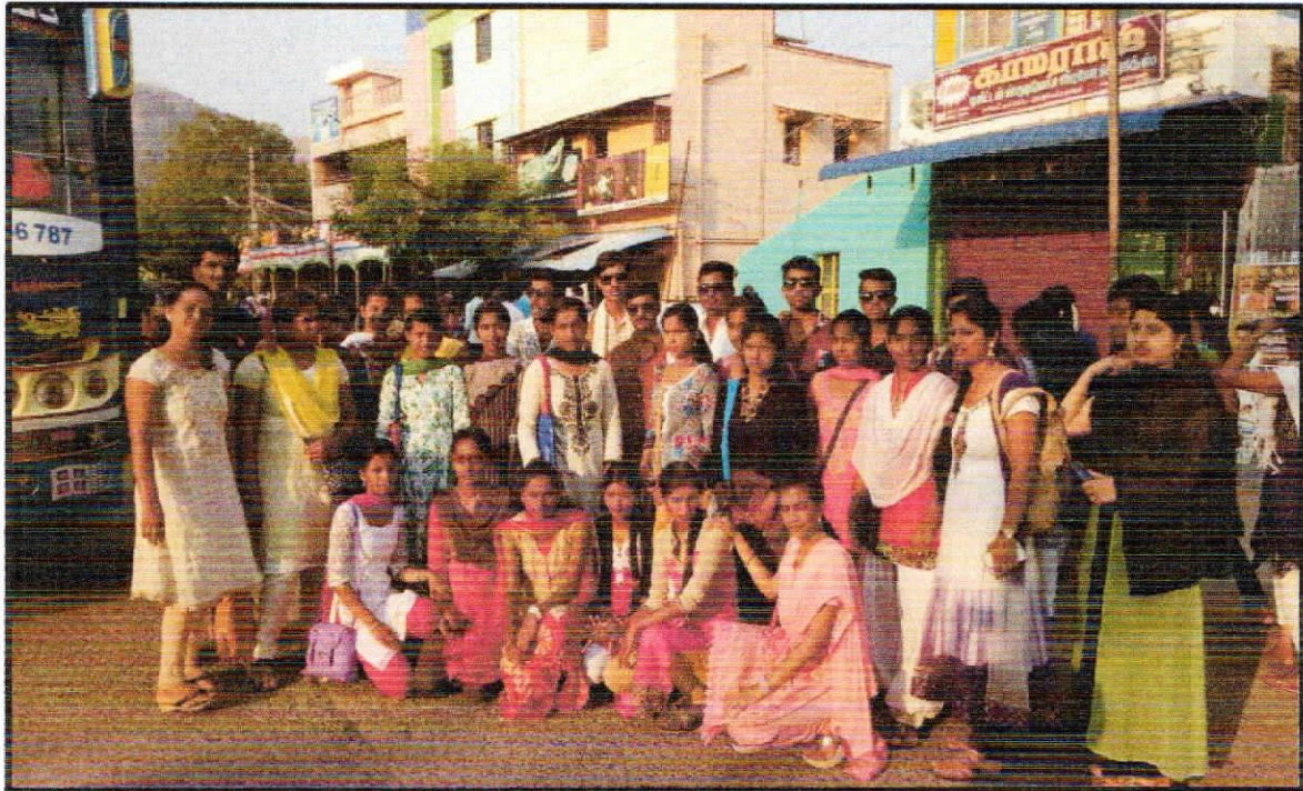
Educational trip on 16-03-2017 to 20-03-2017 for II BSc and III BSc (PCM and PMCs) students of Science department visited in Tamilnadu State