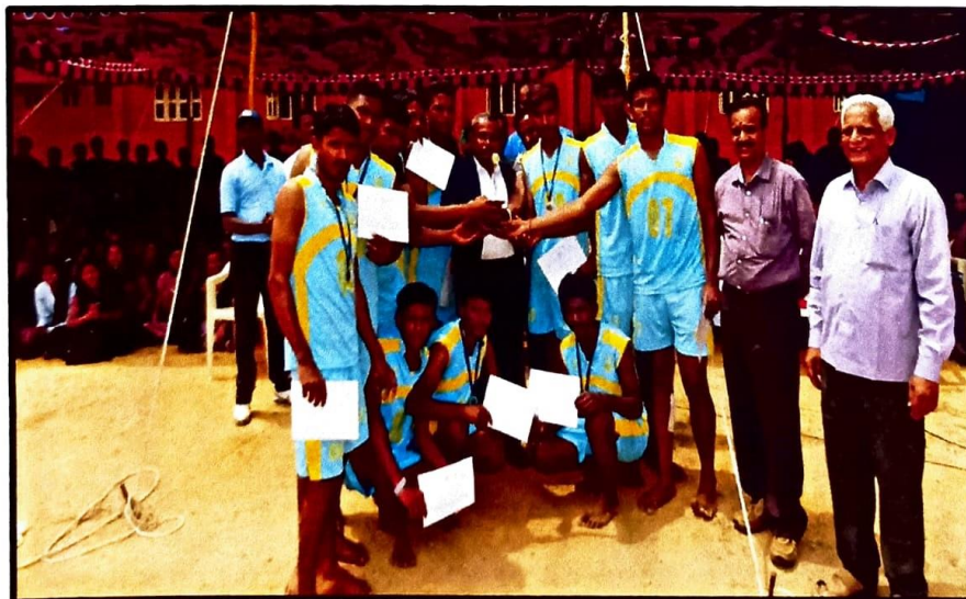
Mandavya Zonal Volleyball Tournament, on 6-10-2016 & 7-10-2016