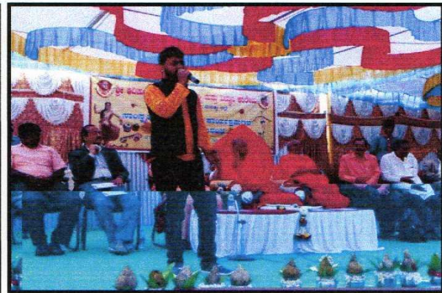
INAUGURATION OF CULTURAL AND SPORTS ACTIVITIES, DATE:-27-10-2016