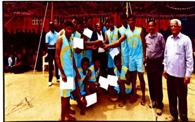
Mandavya Zonal Volleyball Tournament, on 6-10-2016 & 7-10-2016