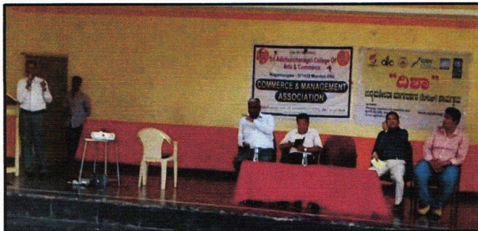
Concentration Programme, Date: 28-12-2018