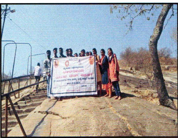
PRINCIPAL Sri Adichunchanagiri College of Arts and Commerce Nagamangala-571 432, Mandya Dist.