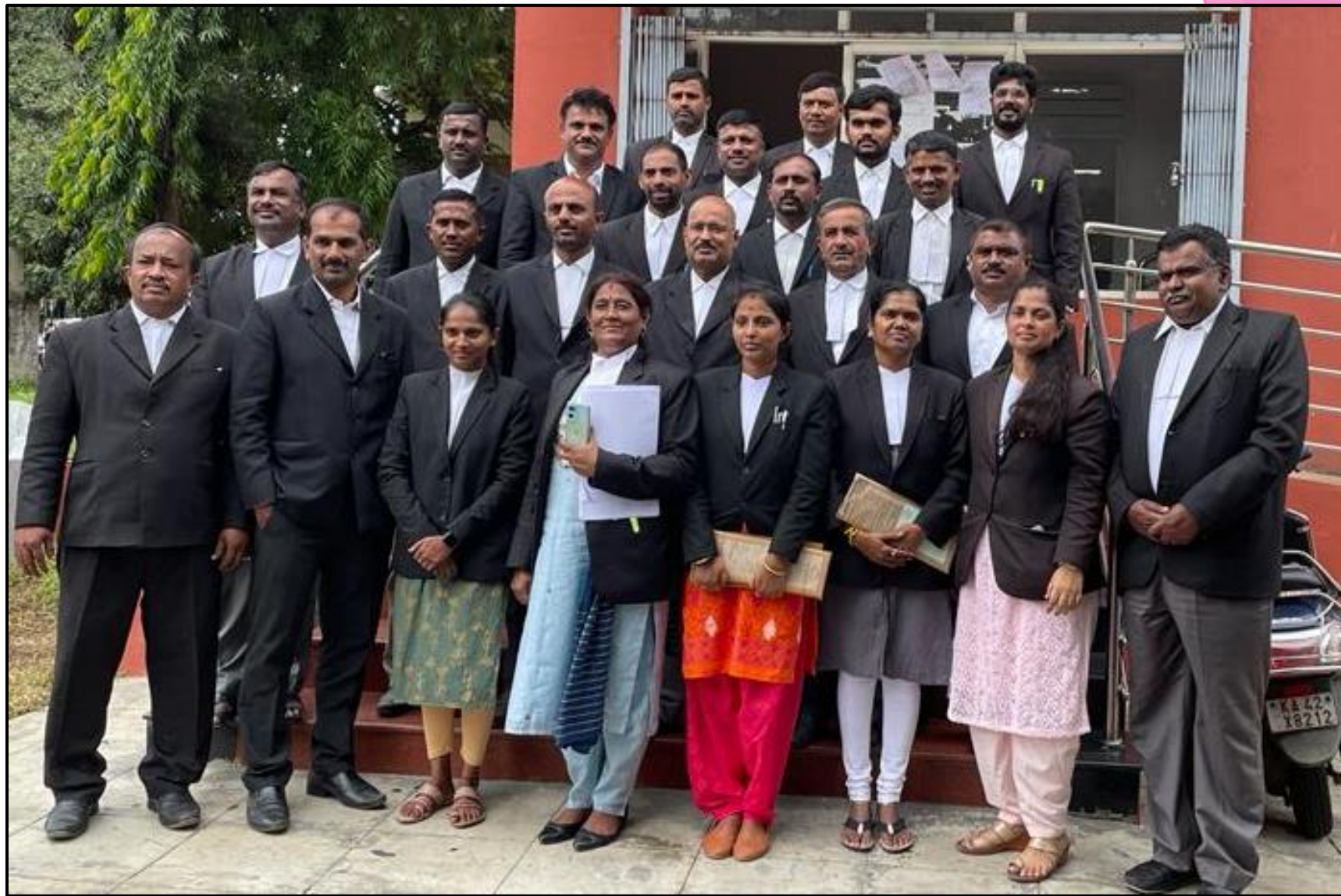
Our Alumni Advocates, JMFC, Nagamangala