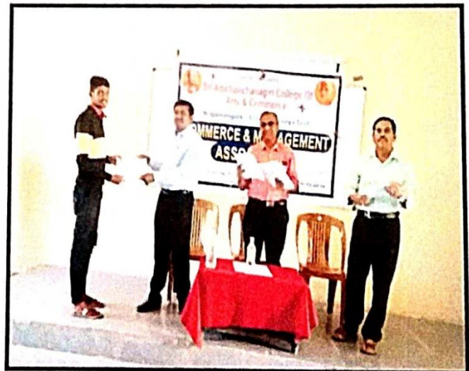
Training Programme on Tally & GST- 06-02-2019